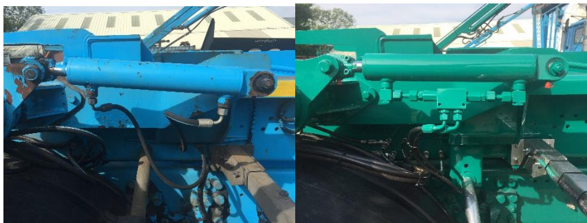
Design to March 2020

Please find pictures of the early design and the later design hydraulic cylinder set up.