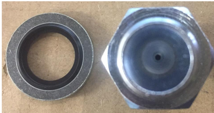
1/4bsp-1/4bsp adaptor/restrictor and dowty washer 10862

The new system is cross compatible with the earlier design with the addition of the 1/4bsp-1/4bsp adaptor/restrictor part number 203972 and dowty washer part number 10862